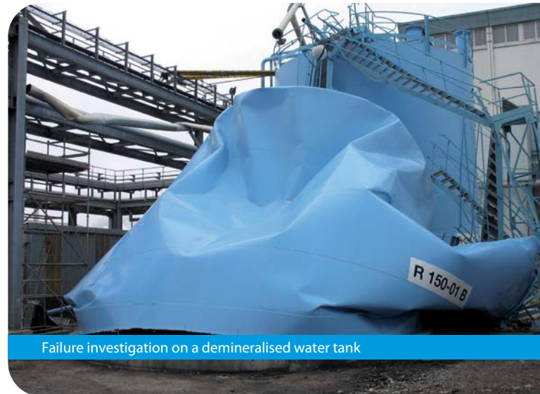
Failure investigation on a demineralised water tank